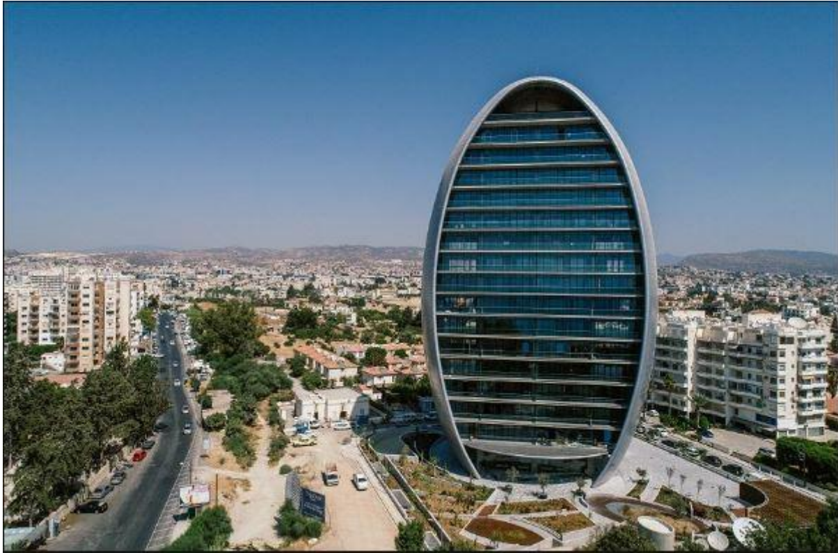
Figure 4. The Oval