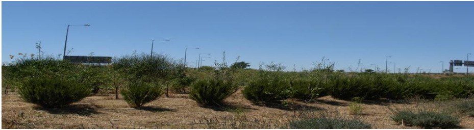
Fig. 1 K4 interchange-Planting Area

protection of the natural and manmade environments by implementing innovative measures for protection and landscape restoration. Completed specialized landscape restoration studies with innovative planting methods using endemic plants. Basic condition for the well establishment of plants to the planting areas is drip irrigation through the establishment of permanent water pipe distribution network. The modern systems of water distribution for plants irrigation in large – scale highways projects due to the high water saving offer have established as the most efficient and easier to use with multiple economic benefits for both the user and for the country's economy general. These systems are consisted by various diameters of water distribution pipes and components for controlling protection and water supply network irrigation. The case of K4 interchange in Thessaloniki is the practical application of measures that EGNATIA ODOS S.A. has designated for rehabilitation and aesthetic improvement of the urban landscape. The success of these projects largely is based on premium designed and well-constructed closed water distribution pipe network with drip irrigation.