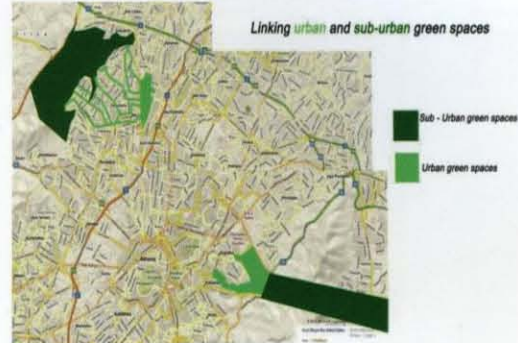
The 2 proposal of linking parts of the City of Athens with Urban and Periurban Parks

base while enjoying the scenery of the forested area through which it passes.