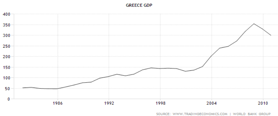
Chart 1 – Greece, GDP (in billion euros)

However, under the surface of prosperity, structural problems became bigger and bigger: the state expanded its economic activities (the phenomenon of economic statism became endemic) whereas the private sector of economy shrank, political clientelism and populism prevailed, public administration was ineffective, tax evasion became a menace for public revenues, productivity rates fell drastically, public debt grew immensely, the pension system gradually became unsustainable. These phenomena were the results of the establishment of 'a misleading model of political, economic and institutional development' 2 .