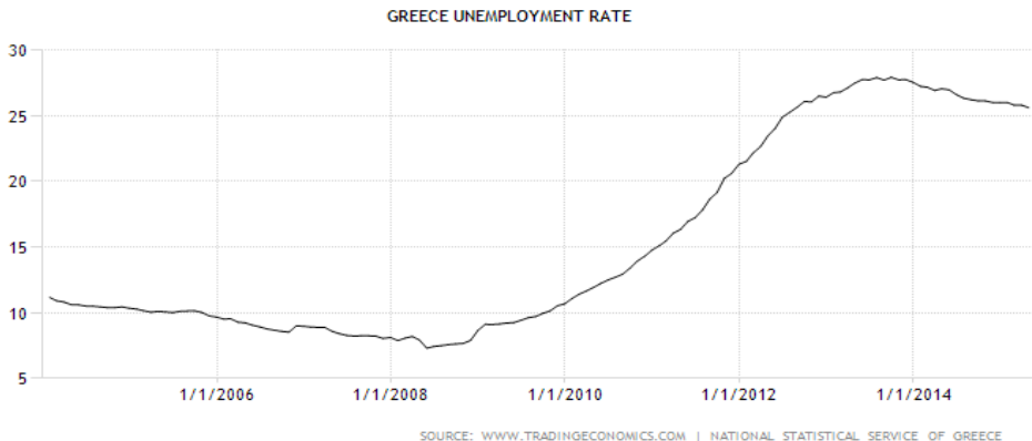
Chart 3 – Greece, Unemployment rate

After the elections of June 2012 a coalition government composed of New Democracy, PASOK and the Democratic Left with the former's leader, Antonis Samaras, as the Prime Minister was formed 6 . The new government was more successful than its predecessors meaning that the number of reforms that were implemented was a bit higher, primary surpluses in the state budget were achieved, the economy was stabilized, and by the end