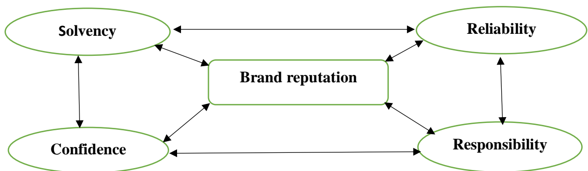
Figure 1: Expectations of those involved in an organization (Loureiro et al., 2017: 18)

According to Loureiro et al., (2017) each stakeholder group has different expectations of an organization in order to form a positive perception of it.