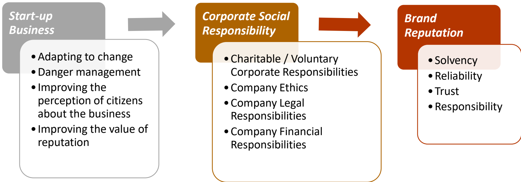
Figure 2: Initial Conceptual Framework