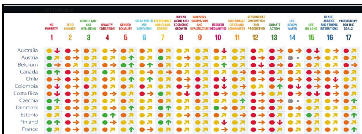
DIAGRAM 2: 2023 SDG dashboards for OECD countries (levels and trends)

Diagram 1 demonstrates how a number of UN States - the first six- are ranked by their overall score; the overall score measures the total progress towards achieving all 17 SDGs. 183 According to Diagram 1, Denmark's performance is ranked third out of 166 UN States with an overall score of 85,7%. This indicates the country's strong efforts and progress in addressing global challenges.