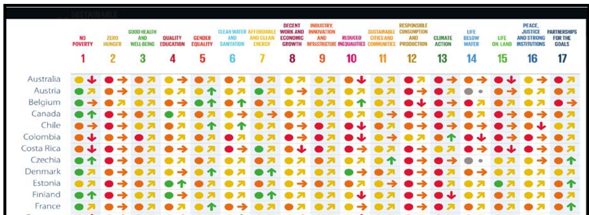
DIAGRAM 2: 2023 SDG dashboards for OECD countries (levels and trends)

Diagram 1 demonstrates how a number of UN States - the first six- are ranked by their overall score; the overall score measures the total progress towards achieving all 17 SDGs. 183 According to Diagram 1, Denmark’s performance is ranked third out of 166 UN States with an overall score of 85,7%. This indicates the country’s strong efforts and progress in addressing global challenges.