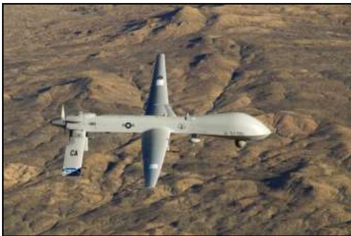
Diagram 3: Armed MQ-1 Predator Drone

Drones are another example of legal and ethical counterterrorism. The drone may be an effective counterterrorism tool (Farrow, 2016). However, it has major consequences for the general populace where the U.S. fights terrorism. US covert drone activities raise two concerns, according to Shah and Chopra et al. (2012). The first and most typically stated is secrecy, which affects force accountability; second, drone platforms' limitations outside of full-scale military operations affect public protection and injury response. Drones weaken sovereignty, limit accountability due to secrecy, violate international law, and may cause diplomatic crises. Neman's (2017) study found that Yemeni teenagers targeted by American drone attacks often expressed their fury, hatred, and desire for retaliation against the drone operators. This supports the allegation that drone strikes promote anti-Americanism and radicalize people (Morris, 2019).