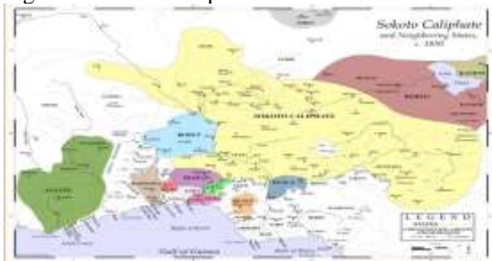
Figure 2: Sokoto Caliphate

Madani Timbuktu Traditions 2012, Map of Sokoto Caliphate, digital image, accessed 30 March, 2024, https://madanitimbukti.wordpress.com/2012/05/12/the-sakwatto-model/sokoto-caliphate2/