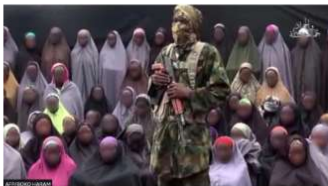
Figure 7: kidnapped Chibok School girls (BBC 2016)

BBC News 2016, kidnapped Chibok girls, accessed 30 March 2024. https://www.bbc.com/news/world-africa-37641101