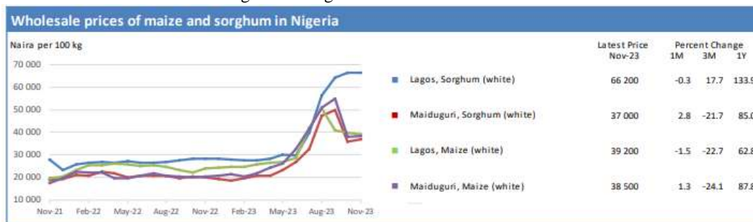
Chart 1: Prices of maize and sorghum in Nigeria

Food and Agricultural Organization of the United Nations