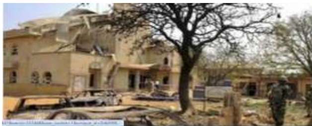
Figure 5: Destroyed Mandala Catholic Church (MailOnline 2011)

Mail Online 2011, destroyed Mandala Catholic Church, digital image, accessed 30, March 2024. https://www.dailymail.co.uk/news/article-2078450/Bombs-kill-32-Catholic-churches-Christmas-Day-mass-series-explosions-rock-Nigeria.html