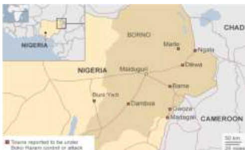
Figure 13: Boko Haram affects towns and communities

BBC News, Nigeria's Boko Haram 'Seize' Bama town in Borno, 2 September 2014, accessed 26 April 2024. https://www.bbc.com/news/world-africa-29021037 .