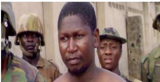
Figure 3: Mohammed Yusuf.

The Guardian 2016, Photo of Mohammed Yusuf then leader of Boko Haram arrested, digital image, accessed 30, March 2024. https://www.theguardian.com/world/2016/feb/04/join-us-or-die-birth-of-boko-haram