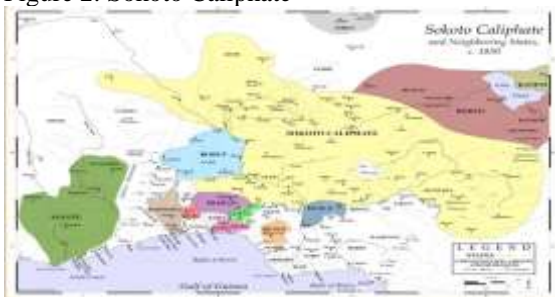
Figure 2: Sokoto Caliphate

Madani Timbuktu Traditions 2012, Map of Sokoto Caliphate, digital image, accessed 30 March, 2024, https://madanitimbukti.wordpress.com/2012/05/12/the-sakwatto-model/sokoto-caliphate2/