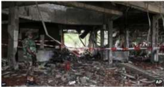
Figure 4: Destroyed UN building (Guardian, 2011)

The Guardian 2011, image of destroyed UN building, accessed 30 March 2024. https://www.theguardian.com/world/gallery/2011/aug/26/bomb-abuja-united-nations-offices