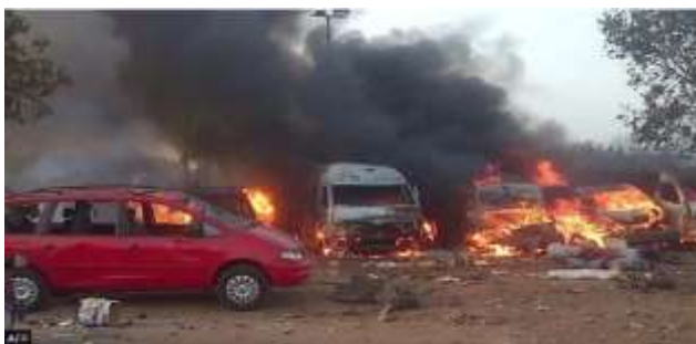
Figure 6: Destroy Nyanya Motor Park (CNN 2014)

CNN, April 14, 2014, destroyed Nyanya motor park, accessed 30 March 2024. https://edition.cnn.com/2014/04/14/world/gallery/nigeria-bus-station-blast/index.html