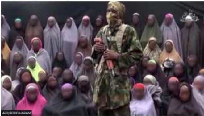
Figure 7: kidnapped Chibok School girls (BBC 2016)

BBC News 2016, kidnapped Chibok girls, accessed 30 March 2024. https://www.bbc.com/news/world-africa-37641101