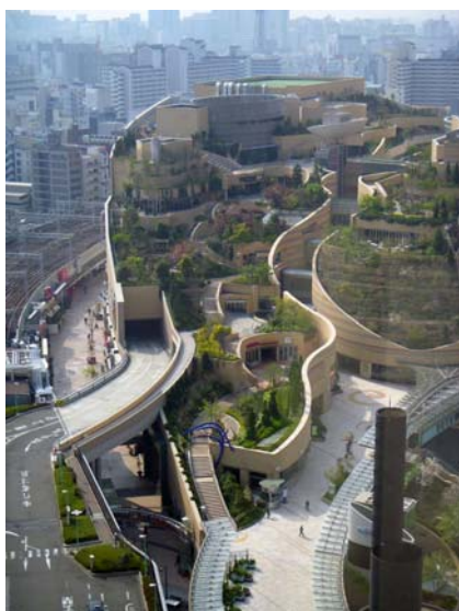
Fig.7 Namba commercial centre Japan

When the roof landscaping is interrelated with building structures (Fig.7,8) there the results are unanticipated. The terrain borrows the plasticity of the building and is impose on the structural components with the dynamism that only living elements can add on the cold still urban landscapes.