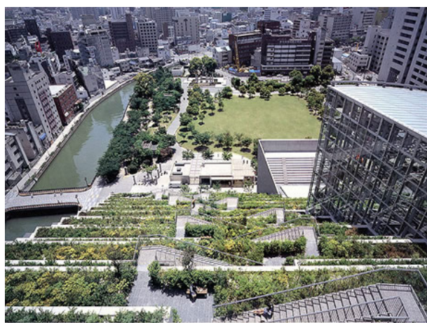
Fig.9, 10 Fuokoka Japan

also during its function is more important in the long term and will compensate for any higher initial construction costs (Fig.9,10).