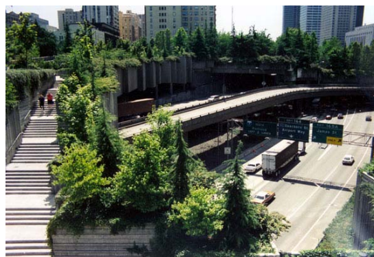
(Fig.1 Freeway Park http://w/ww.seattle.gov/PARKS/park_detail.asp?ID=312 )

A common parameter in naming a terrace a roof landscape could be the basic constructive profile that is made of different layers in order to provide safety for the building and its user and for the construction of the terrace itself. This way a roof terrace can be defined as any space designed with or without planting, separated from the ground by a man made structure. This definition though releases the roof landscape concept from any restriction that limits it to be on a roof. The range of possibilities is expanded and a roof landscape can have any form and