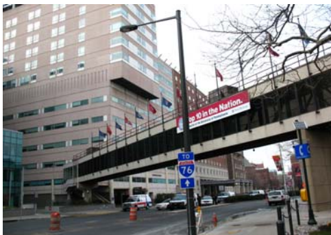
Fig.4 Overhead passage in London

districts once again. He describes his approach thus: "...the trick is to perceive the old freeway as part of the cityscape and tame it rather than complain about it..." [4] Halprin has deliberately turned his back on any temptation to create an artificial naturalness. In various spots there are openings with views to the freeway. The Halprin's design had a vision and this is what differentiates it from other similar projects