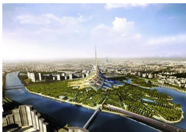
Fig.9 Crystal island Moscow

( http://www.psfk.com/wp-content/uploads/2008/10/singapore-green-roof.jpg )