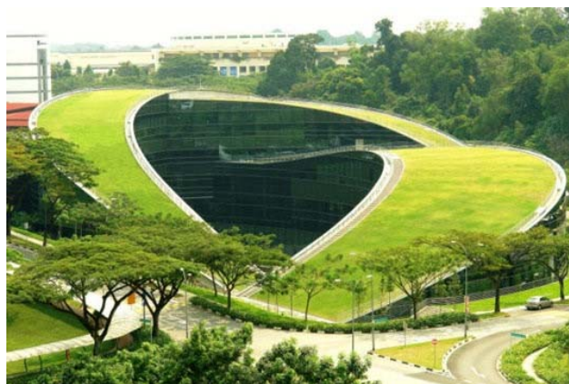
Fig.8 School of ART, Design and Media at Nanyang Technological University, Singapore

advantages add a long term low cost function to the building and increase the environmental benefits. Contemporary designs propose even larger areas of roof terracing, like a project in Moscow (Fig.9) where a whole city is created under a vast terrace. Such projects that offer a greener image to the city in previous years would be considered unconstructable because of the increased cost.