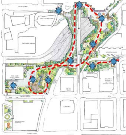
(Fig.2 Freeway Park http://www.seattle.gov/PARKS/park_detail.asp?ID=312 )

Past examples like the Freeway Park in Seattle, verify the notion that vegetation and free pedestrian area can enhance the quality of urban life and create living spaces that last in time. Halprin's radical proposal was to create a more extensive landscape which in a sense "ignored" the freeway by building over it, thus connecting the two