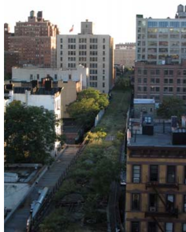
(Fig.5,6 Highline NY http://www.thehighline.org/design/prelim_design/highline.htm )