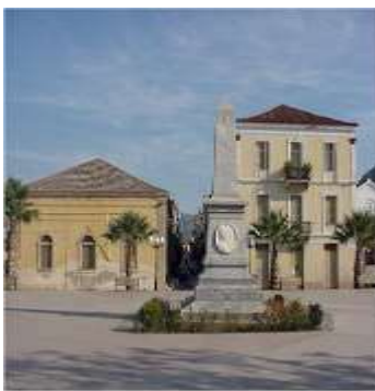
Fig.2: Greek neoclassic Buildings elaborated by Palm Trees in Nauplio

4.2 The climate: Nauplio is a place with gentle, mild temperatures. Its longitude is 37,7°C. The mid annual temperature point is 18, 7°C, with July as the warmer month and January the cooler one. The mid annual rainfall is 510,1mm, with low points during the summertime. Nauplio chances lack of strong Winds, or winter frosts, or summer desiccations, as it happens in many places in all over Greece. Thus Nauplio has specific microclimatic conditions, so it could be the