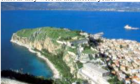
Fig. 1: The acropolis of Nauplio. Natural rock formation penicula length 900m and 400m height was entrenchment of the hill since Venetian Times.

In particular the place of study concerns four formatted borders along the Old Interchange, which called Park O.S.E. The general formation of the landscape is flat and in the sea elevation. Northwest is Palamidi, a castle on a mountain, with 1000 steps, and the Old city of Nauplio, where many buildings exist as they were in the ancient years.