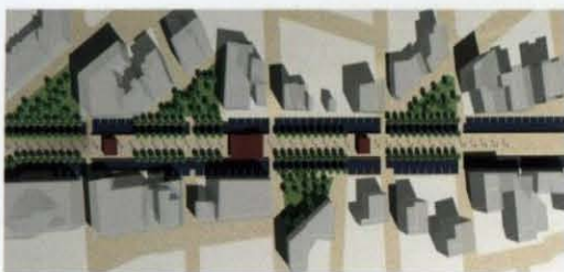
The transformation of Ulof Palme road to Rambla.

The aim of this design is to use the area by pedestrians, bicyclist and motorists and the one use to compete without compete the other.