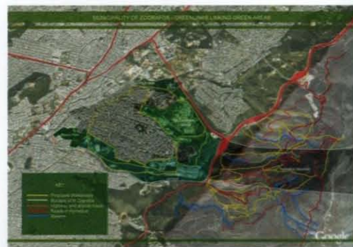
The Greenlink Project in Zografou, Athens

An addition to these, greenways serve as a educational paths which gives historical and cultural information for city inhabitants walking in the street. Athens is a desirable study site for three reasons.