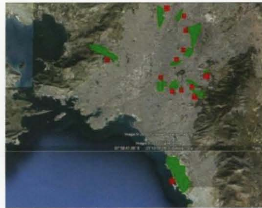
The major green areas in Athens

By fostering connectivity, genetic stagnation is alleviated through reduction of island population and the resulting inbreeding (Little, 1990; Noss, 1987, Georgi and Dimitriou, 2010). Greenways benefit other ecological processes by helping sustain water quality, abate pollution, deter soil erosion and facilitate the exchange of energy and nutrients within the system (Jongman, 2003; Noss, 1987, Georgi and Zafiriadis, 2006).