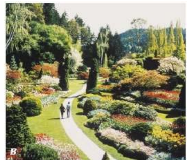
Figure 2a and b: The Butchart Gardens in British Columbia in Canada.