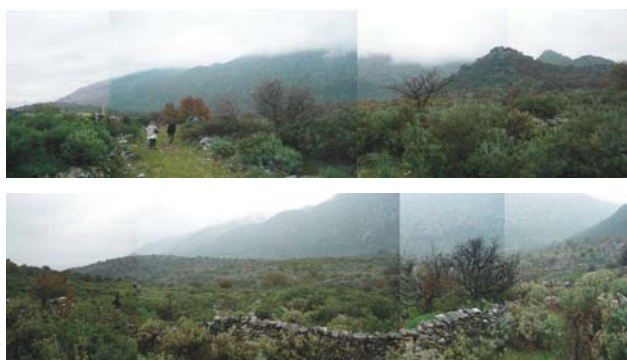
Figure 4: The existing situation of the area.

In the natural environment beyond the ecological consciousness and awareness, the materials as well as the ways used for constructions are also considered important. Materials with light colours friendly to the environment have to